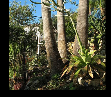
Tillandsia rauhii is a spectacular, huge growing Tillandsia . It takes many years to grow from seeds but the wait is worth it. Imagine a cliff dweller over a meter across that produces an inflorescence that approaches two meters and has deep, black purple flowers for over a year! The collector may need to get some larger acrylic block letters cut...

Tillandsia bulbosa Easy to grow with typical Tillandsia care. Prefers less light that most species.