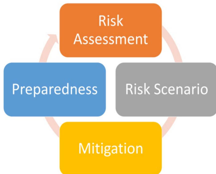
Figure 4: Cycle of Risk Assessments