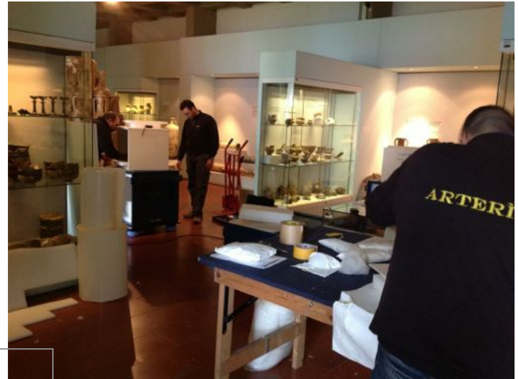
Lipari, Sicily Museo Archeologico