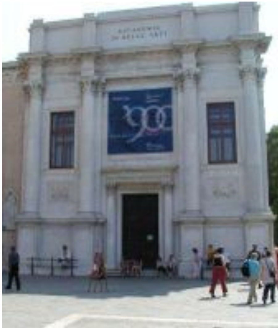
Venezia Gallerie dell'Accademia

ARCS Inaugural Conference - Chicago, IL - Oct. 31st Nov. 3rd 2013