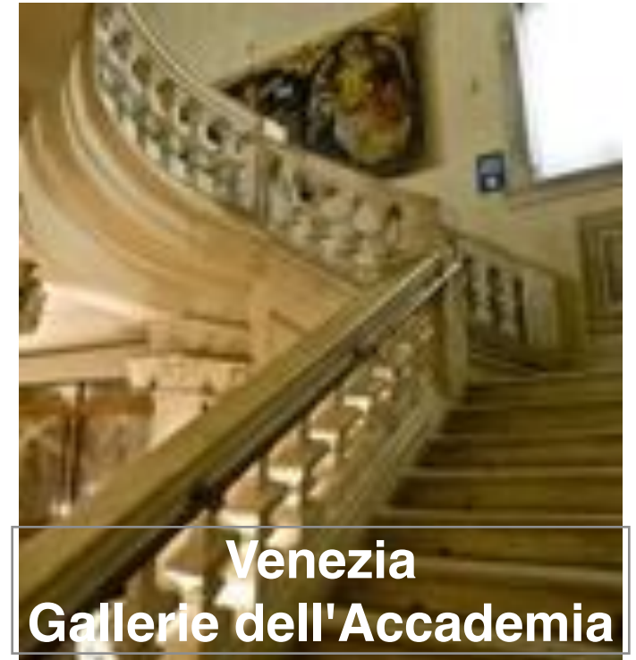
Venezia Gallerie dell'Accademia