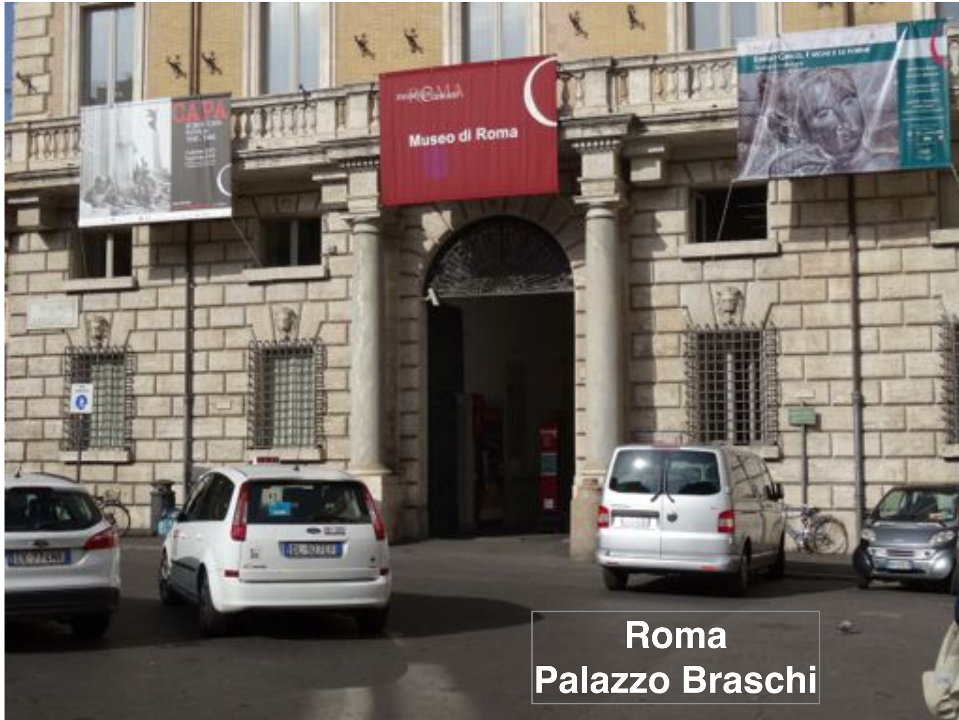
Roma Palazzo Braschi

ARCS Inaugural Conference - Chicago, IL - Oct. 31st Nov. 3rd 2013