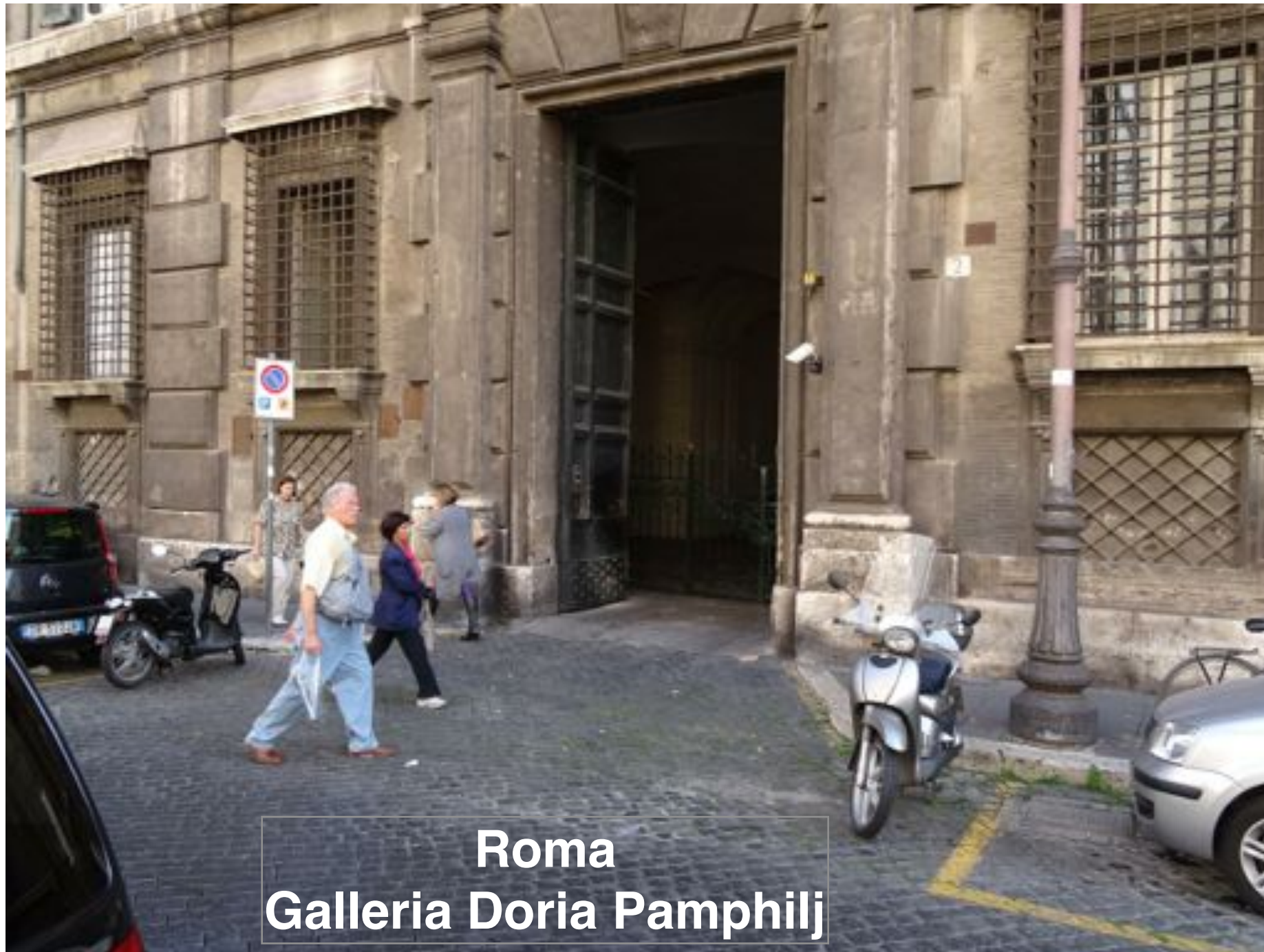
Roma Galleria Doria Pamphilj

ARCS Inaugural Conference - Chicago, IL - Oct. 31st Nov. 3rd 2013