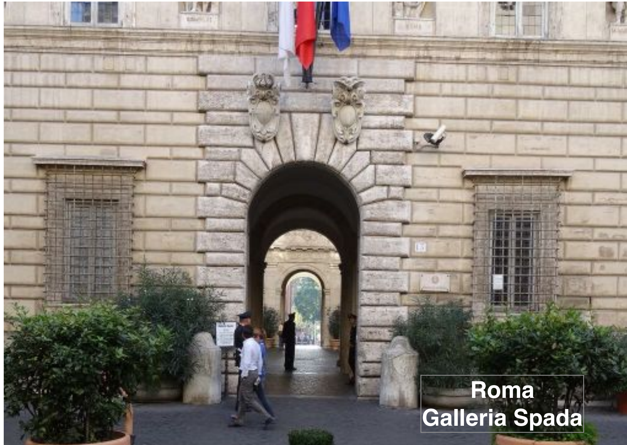
Roma Galleria Spada

ARCS Inaugural Conference - Chicago, IL - Oct. 31st Nov. 3rd 2013