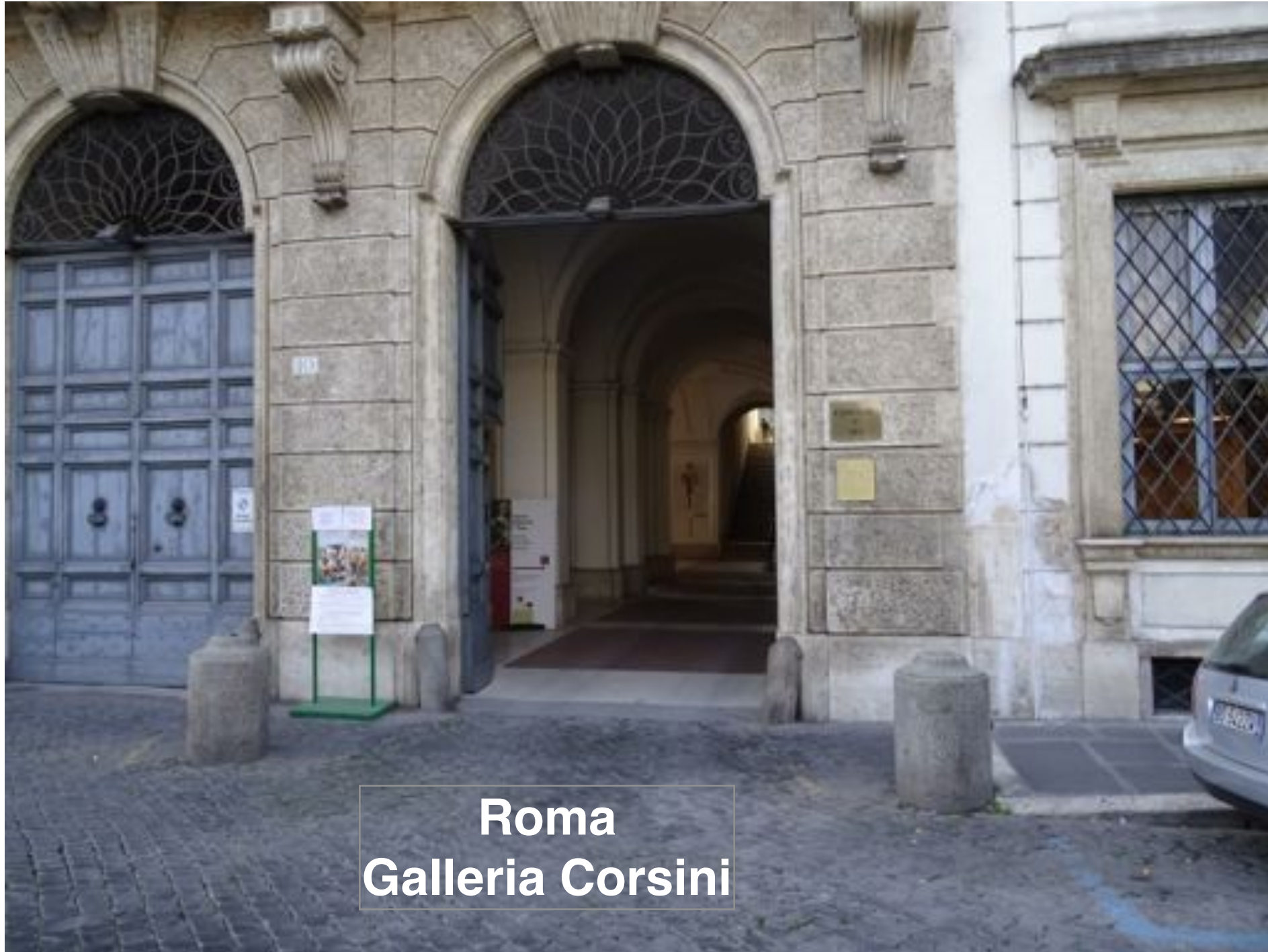
Roma Galleria Corsini

ARCS Inaugural Conference - Chicago, IL - Oct. 31st Nov. 3rd 2013