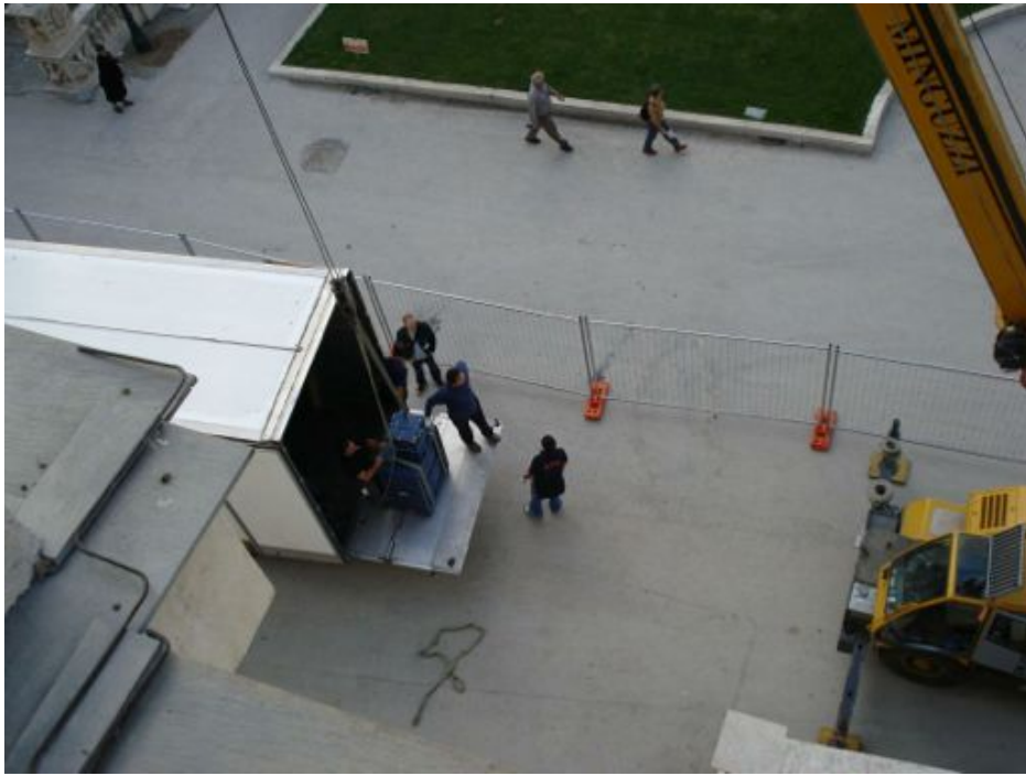
Roma, Galleria Borghese

ARCS Inaugural Conference - Chicago, IL - Oct. 31st Nov. 3rd 2013