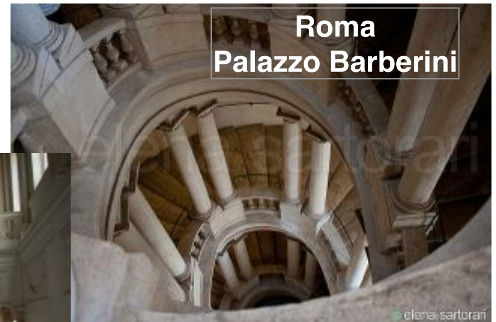
Roma Palazzo Barberini