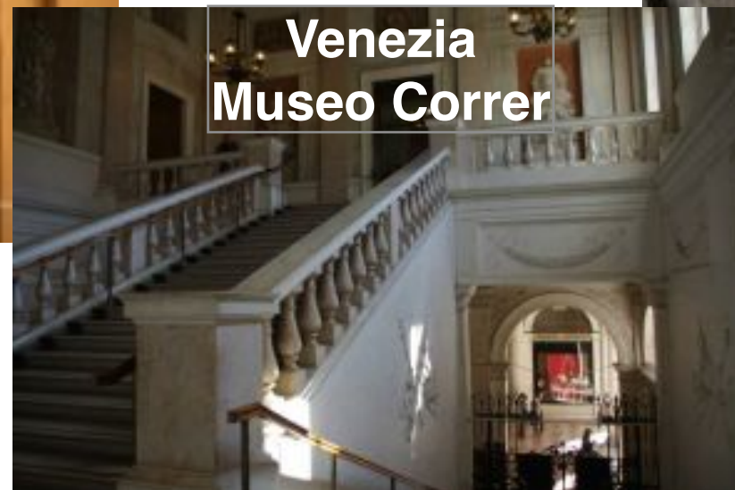
Venezia Museo Correr