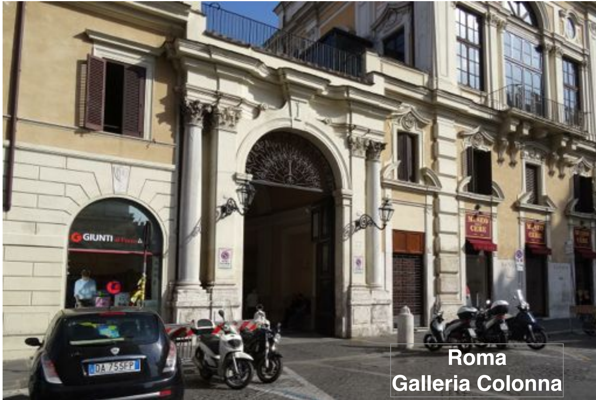
Roma Galleria Colonna

ARCS Inaugural Conference - Chicago, IL - Oct. 31st Nov. 3rd 2013