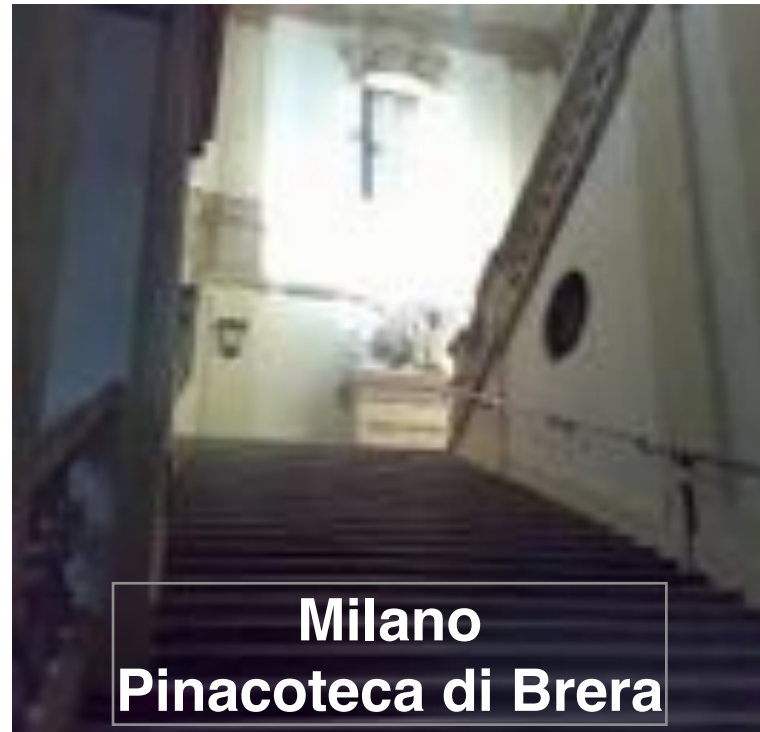
Milano Pinacoteca di Brera

ARCS Inaugural Conference - Chicago, IL - Oct. 31st Nov. 3rd 2013