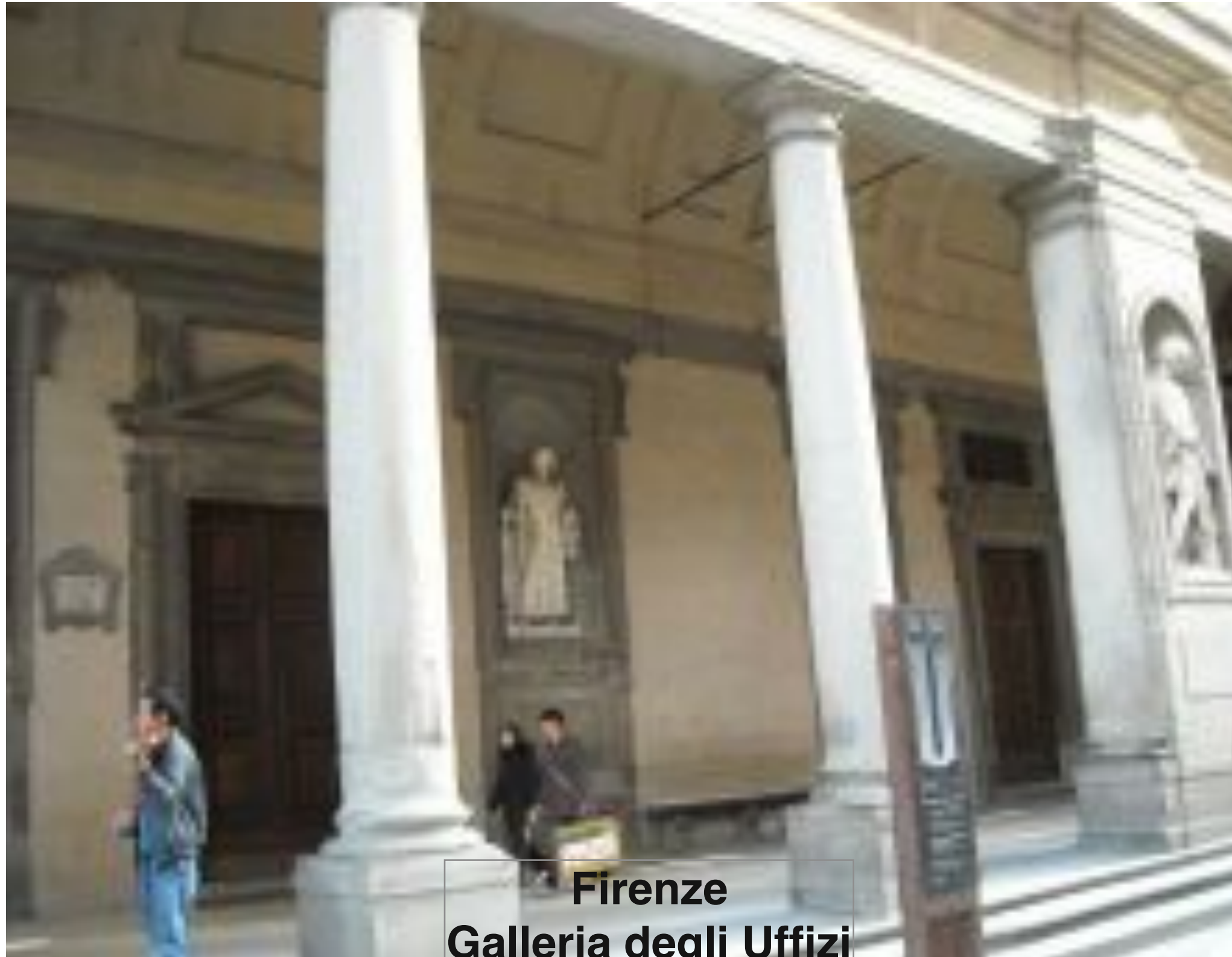
Firenze Galleria degli Uffizi

ARCS Inaugural Conference - Chicago, IL - Oct. 31st Nov. 3rd 2013