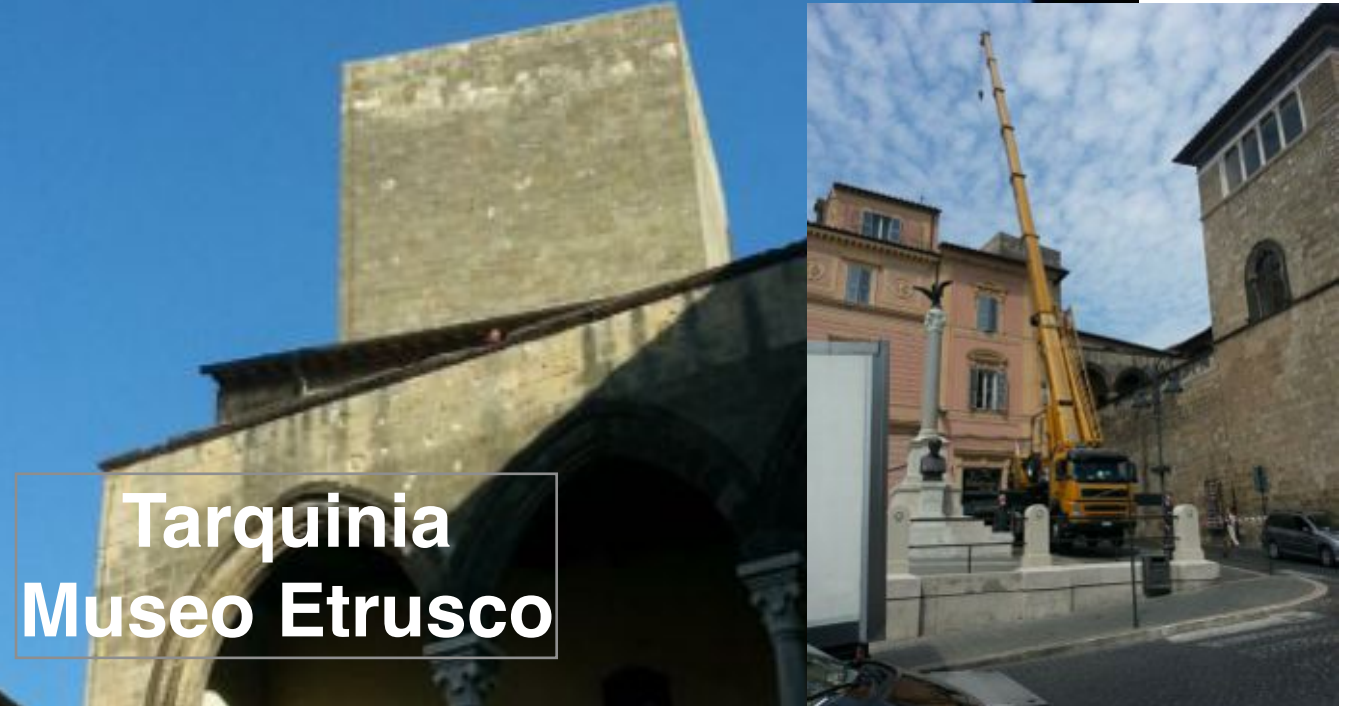
Tarquinia Museo Etrusco