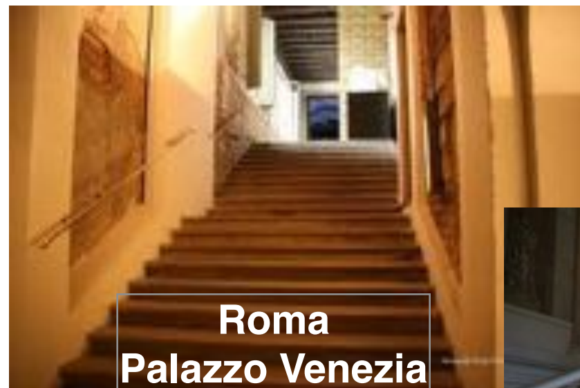
Roma Palazzo Venezia