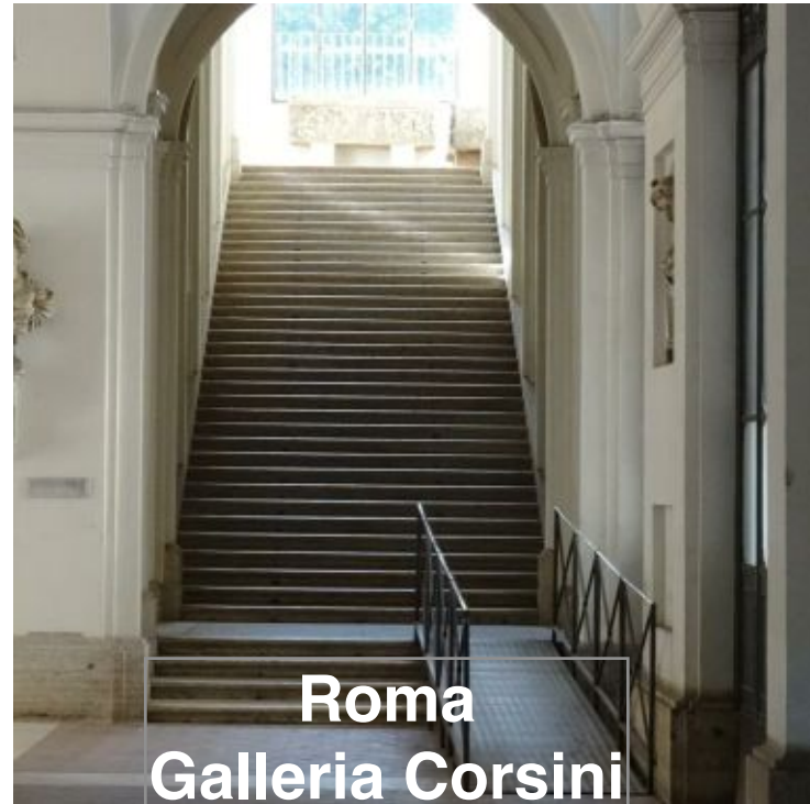
Roma Galleria Corsini