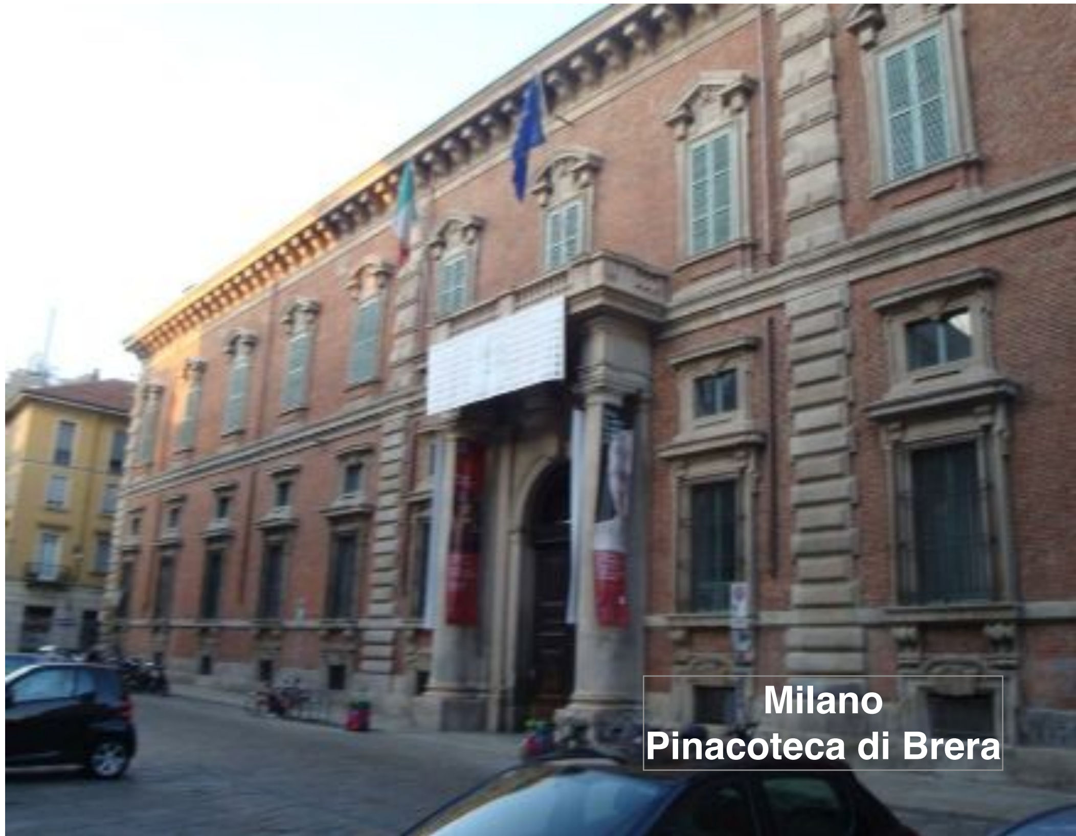
Milano Pinacoteca di Brera

ARCS Inaugural Conference - Chicago, IL - Oct. 31st Nov. 3rd 2013