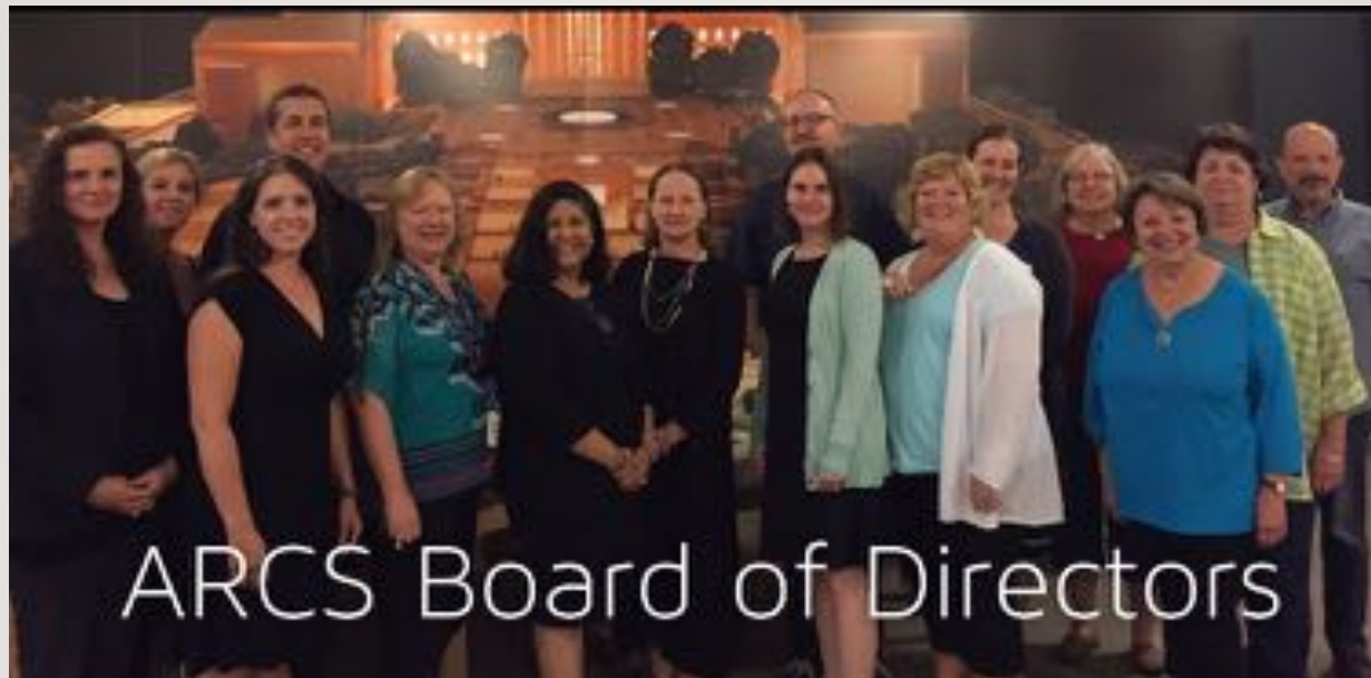
ARCS Board of Directors