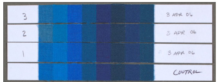
Blue Wool Card in strips and dated

In most cases, a general correlation between the sensitivity of the artifact and the Blue Wool standard's scale will be sufficient to allow informed decision-making.