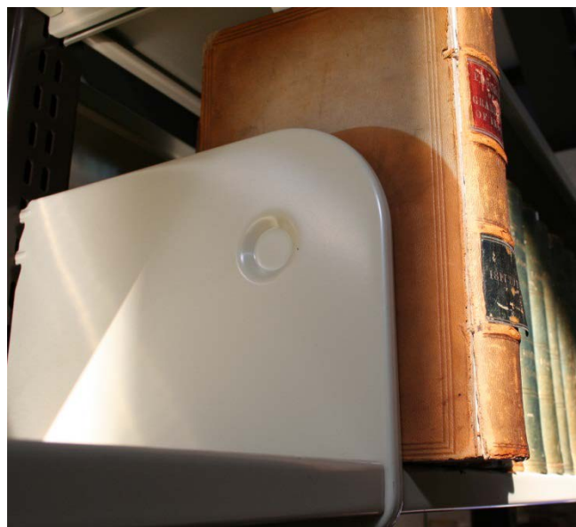
Light damage to leather binding

causes the molecules in the dye to vibrate more quickly, bump into each other like a demolition derby, and change their shape. The light hitting and reflecting off these new molecules changes the speed of the wavelength and thus the color the eye perceives in relation to the dye changes. The general term for this process is photochemical deterioration.