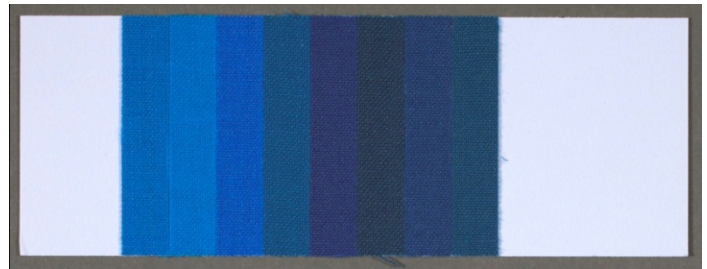
Blue Wool Card

To demonstrate the degree of fading caused by the intensity of light in a particular location, cover half of the card with a light-blocking material to protect it completely from light damage (or cut the card up into strips reserving one as a control). Note the date and set out the Blue Wools in the desired location. Check periodically (every couple of weeks) to determine how long it takes the various samples to fade. Since the sensitivity of the first few samples on the card corresponds to light sensitive materials such as watercolors and textiles, the results will give you a general idea of the amount of damage you might expect if materials were exhibited for the same period of time at the current light level in that location.